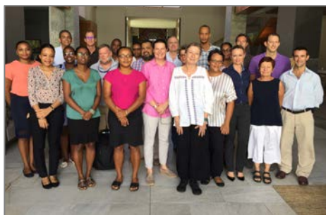
Phase 1 MSP Policy Workshop

SMSP Policy. A draft Policy was produced in 2018. Three stakeholder workshops provided input and the draft will undergo international peer-review. Stakeholder consultations and finalisation will take place in 2019