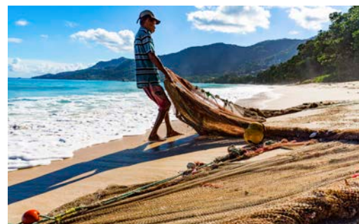
Artisanal fisherman, Mahé.

Monitoring and Enforcement. Implementation plans are being discussed including costs, capacity and infrastructure for monitoring, control and surveillance (MCS). Regulations and mandates for enforcement of marine activities in Seychelles' waters are being examined as well as frameworks, capacity and infrastructure for information sharing in Seychelles and regional coordination for Western Indian Ocean.